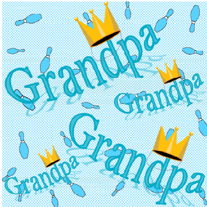
Final Image, saved as a .png file